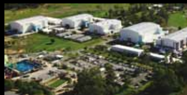
WARNER ROADSHOW STUDIOS