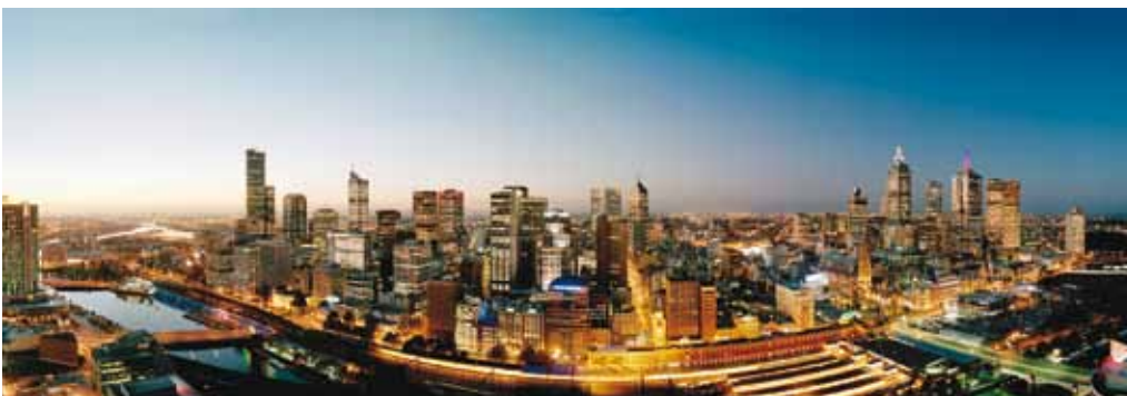
MELBOURNE, VICTORIA

For more detailed information on Australia's incentives read Ausfilm's factsheet: Australian Screen Production Incentives or visit www.ausfilm.com .