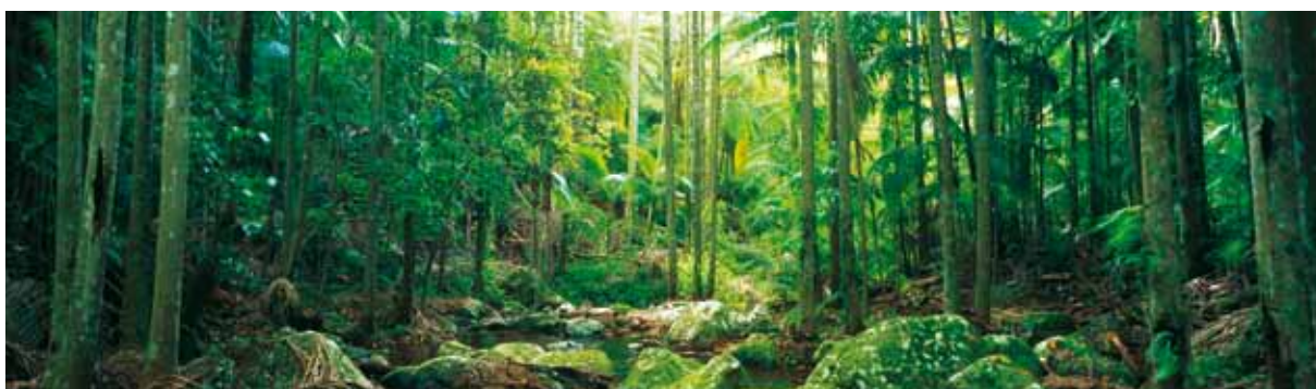
LAMINGTON NATIONAL PARK, QUEENSLAND