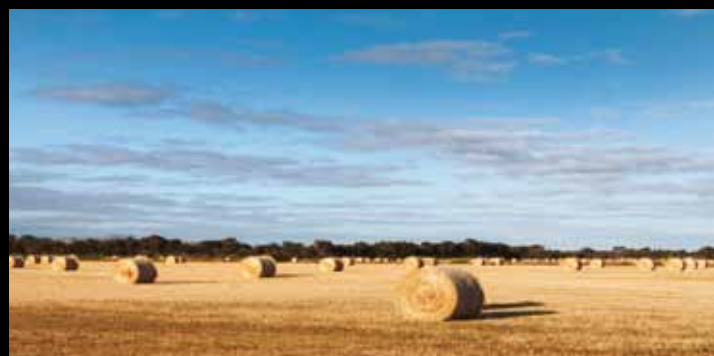
MCLAREN VALE, SOUTH AUSTRALIA