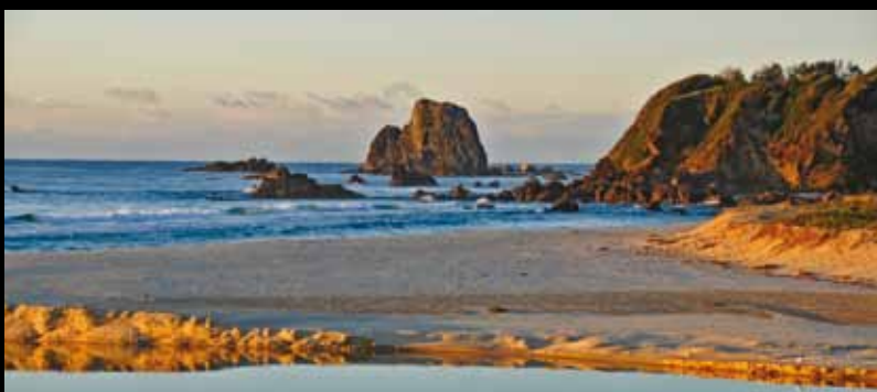
NAROOMA, NEW SOUTH WALES

Adelaide, South Australia T: + 61 8 8348 9300 safilm@safilm.com.au www.safilm.com.au