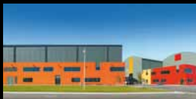
MELBOURNE CENTRAL CITY STUDIOS